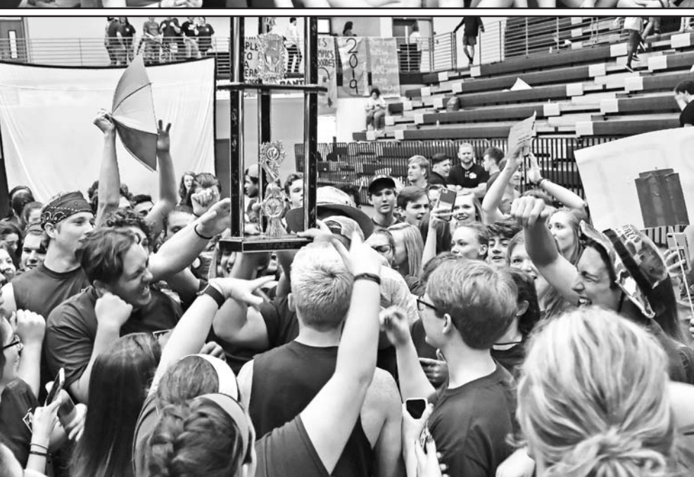
The Class of 2019 are the UCHS Ulympics Champions for the second straight year after locking up the much sought after trophy as sophomores during last year's games. The Ulympics is a class competition that spans the entire school year judging students on academics, behavior, school spirit, athletics, and more.